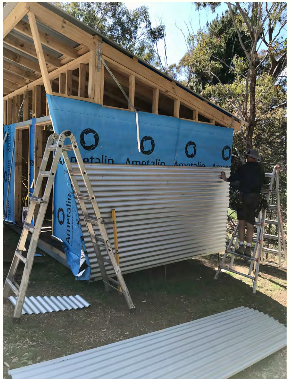
One of our hard working volunteers fixing the steel cladding.

Construction work is progressing according to the availability of key personnel with the required Knowledge and skills. The task of fitting and screw fixing the corrugated steel cladding was commenced on Sunday 24 October with the two side walls and the back wall being fix and screwed off before being called to the AGM Our thanks to Zac Le Lievre for his guidance and metal working skills that are producing a very professional result.