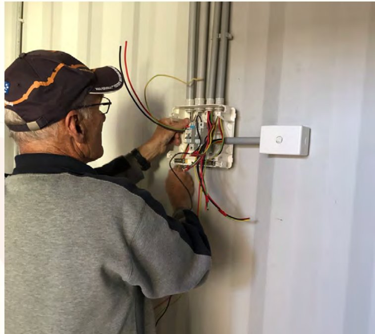
Fitting off one of the new distribution boards

The Fairbairn Park Control Council (FPCC) developed a program to encourage clubs to upgrade the electrical safety of their facilities. Stage two of our program is now complete. The focus was on the Pitstop Café with the installation of new conduit, cables and six new double power outlets in just the right location so appliances can be plugged straight in without the usual myriad of double adaptors or extension cords. Thanks to Phill McPherson for his expertise in managing these upgrades. As a point of interest, long time members of the SDMA would remember Phill competing many years ago in an Austin Healey Sprite and more recently in a Formula Ford.